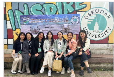
土耳其实地调研 Study Tour to Turkey